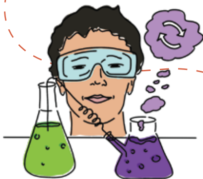
EXPERIMENT AND ITERATE