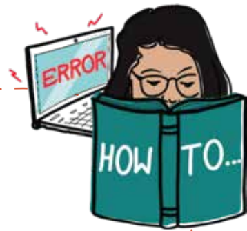
LEARN FROM FAILURES