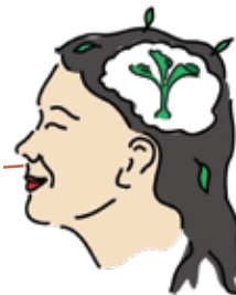
CULTIVATE GROWTH MINDSET