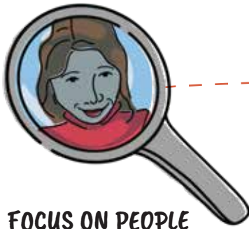
FOCUS ON PEOPLE