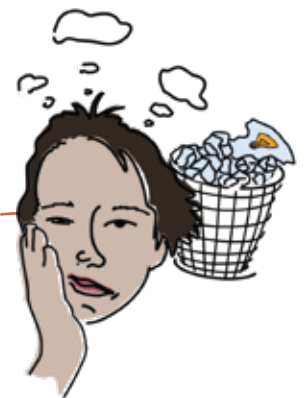
ACT, DON'T OVERTHINK